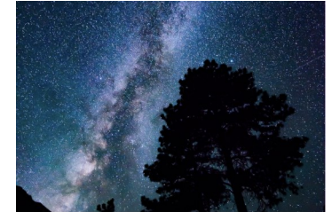
God's Promise to Abraham